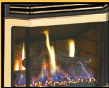
Shown with optional gold door crown and gold rod grille

The TrueGlow Burner, an exclusive from Quadra-Fire, sets a new standard for realism. The ceramic burner is molded from real wood pieces and coals. Flames rise from gas ports distributed throughout the glowing coal bed and lower logs, producing an incredibly active and varied fire. No need to hide the burner anymore—the TrueGlow burner proudly takes center stage, with an appearance that is phenomenal, whether it's burning or not.