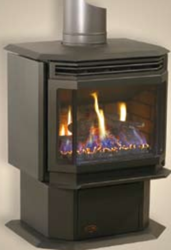
Shown standard black

An ordinary room becomes an inviting living space with the Columbia Bay from Quadra-Fire. Bay window styling, with your choice of black, gold or satin-nickel trim, adds just the right touch of class. Curl up in front of the fire and let the warmth and glow melt away the hassles of the day. High efficiency and great performance keep your heating bills down. And for even more convenience, add a thermostatic remote control.